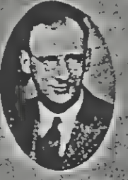
Harold O. Farmer Law